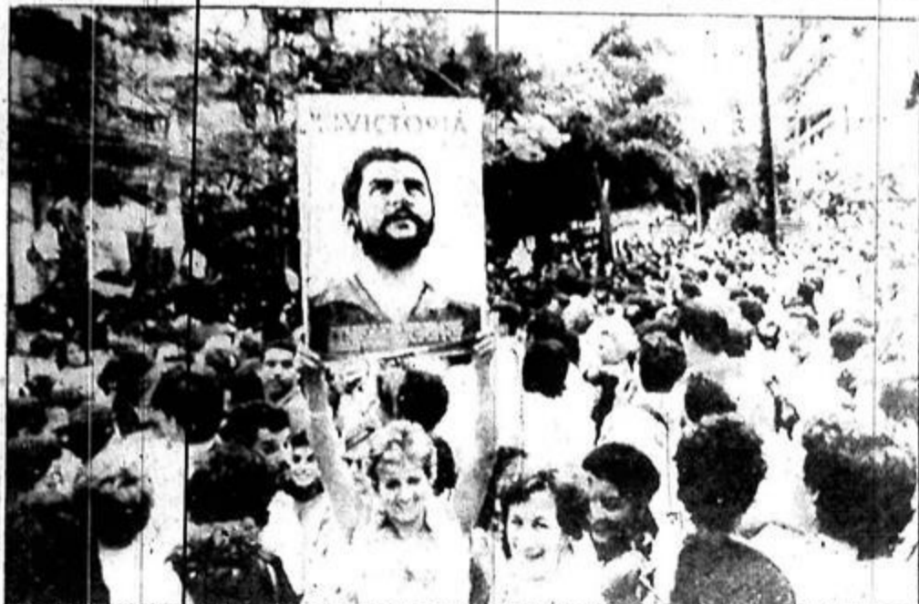
Cubans in Havana demonstrate in front of a house on Thursday where a meeting of human rights activists took place. Cuba has reacted adversely to the U.N. security council singling it out for censure on alleged human rights violation earlier in a U.S.-sponsored resolution.